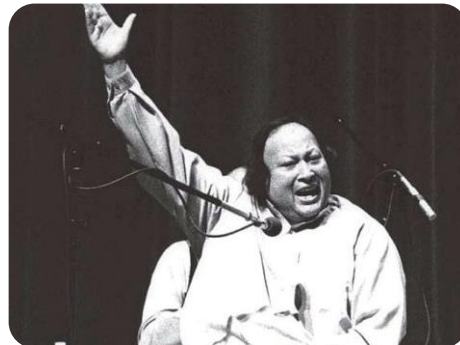
Nusrat Fateh Ali Khan